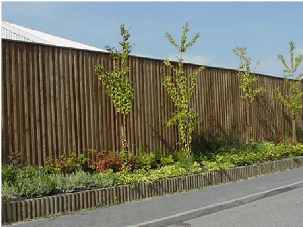
TYPICAL CLOSED BOARD FENCE IMAGE